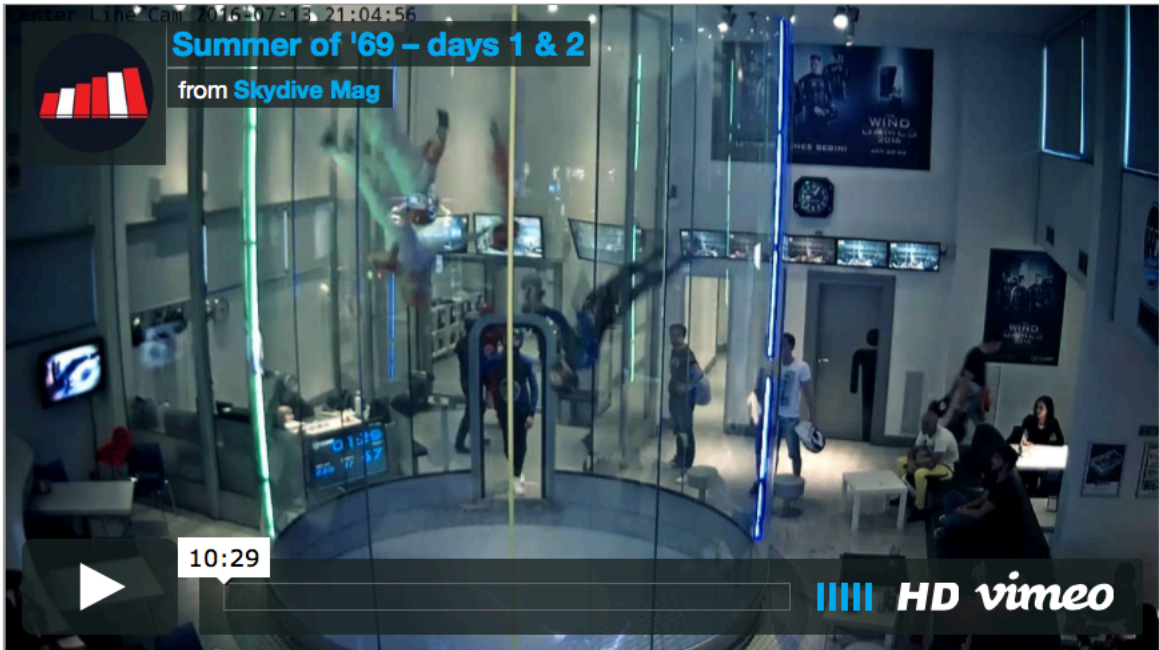
Babylon's Summer of '69 - Highlights, Days 1 and 2