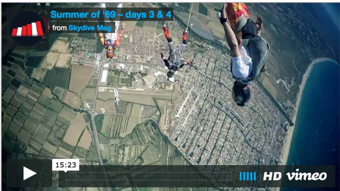
Babylon's Summer of '69 - Highlights, Days 3 and 4